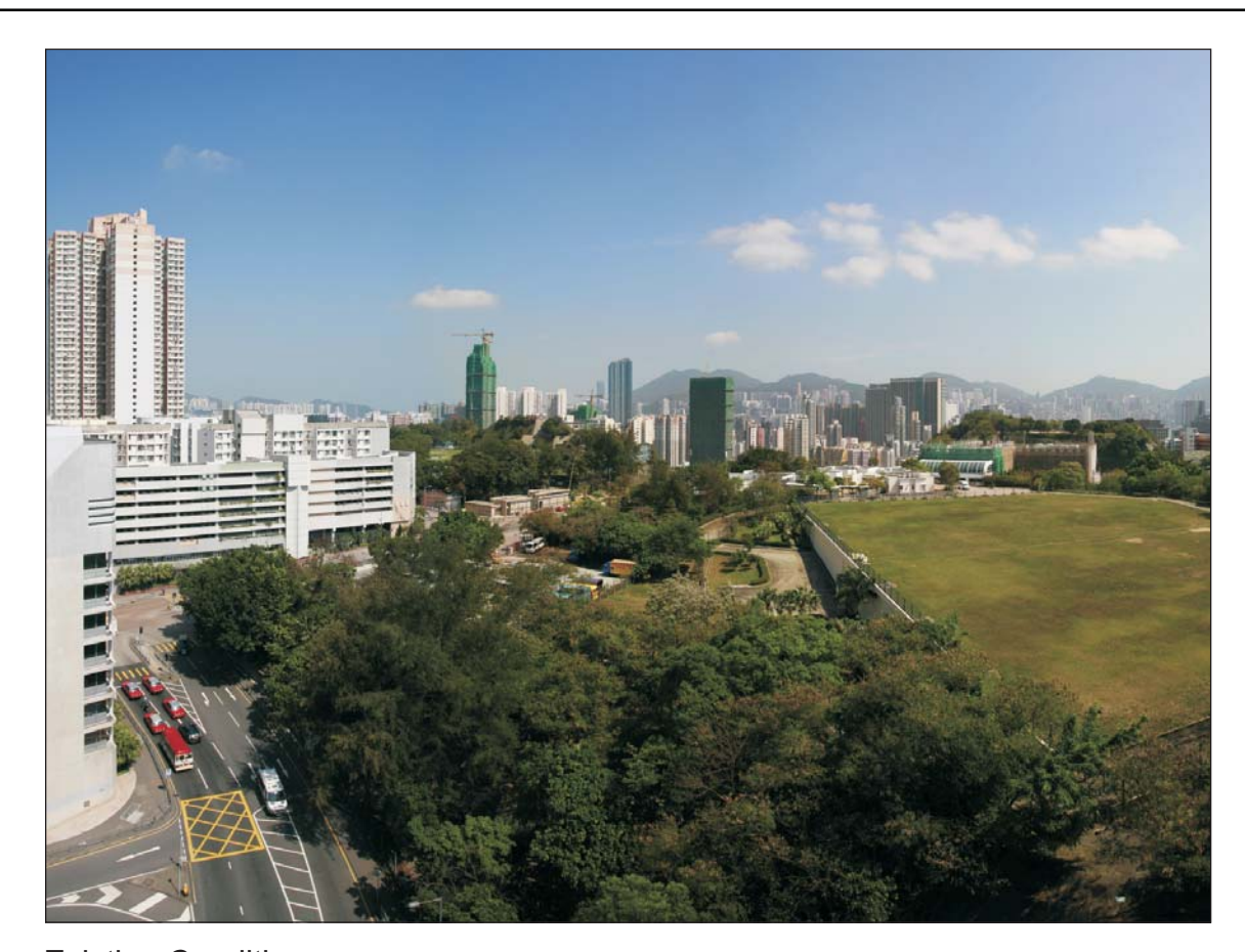
Existing Condition (at Approx.+75 mPD)