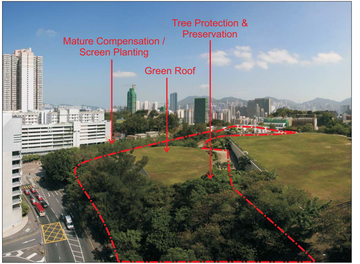
Year 10 with Mitigation Measures